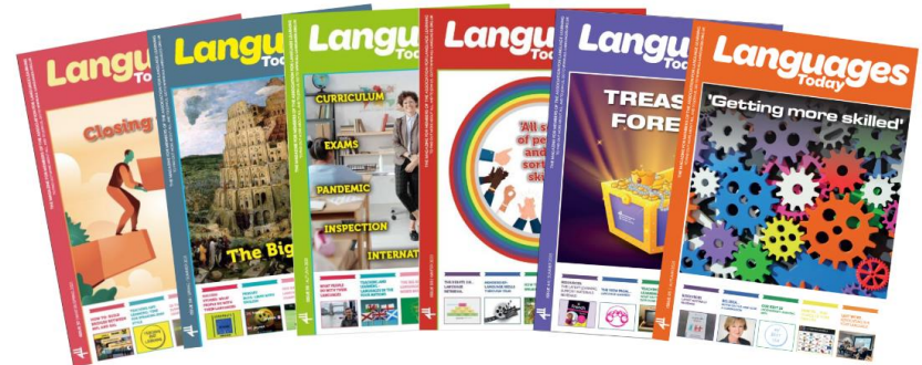
Languages Today: Autumn 2023, Issue 45, 'Getting more skilled'